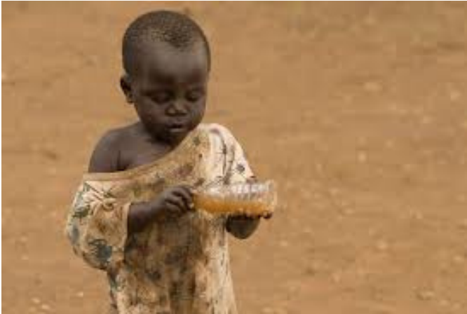
Contaminated Drinking Water

Contaminated drinking water is the reality for most people who are poor and live the rural areas existing on about two dollars a day. For most of these people this is just how it is. Lack of hygienic toilets, lack of rainfall, agricultural runoff, population growth, government corruption, no infrastructure all contribute the water situation. Actually the water situation is only getting worse not better.