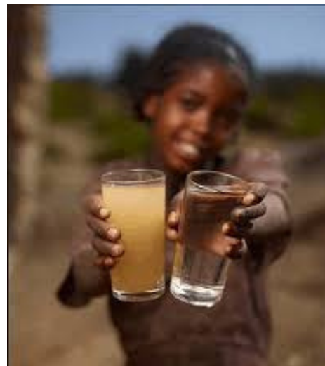
Results of a New Life Filter

After planting churches and by God's grace having had developed a team of leaders, prayerfully TSP has decided to take up the burden of providing families with the gift of clean water while at the same time sharing the gospel with them and providing an opportunity to personally receive Christ as Savior. We believe people should not only have clean water to drink but also hear the gospel and opportunity to respond to Christ personally.