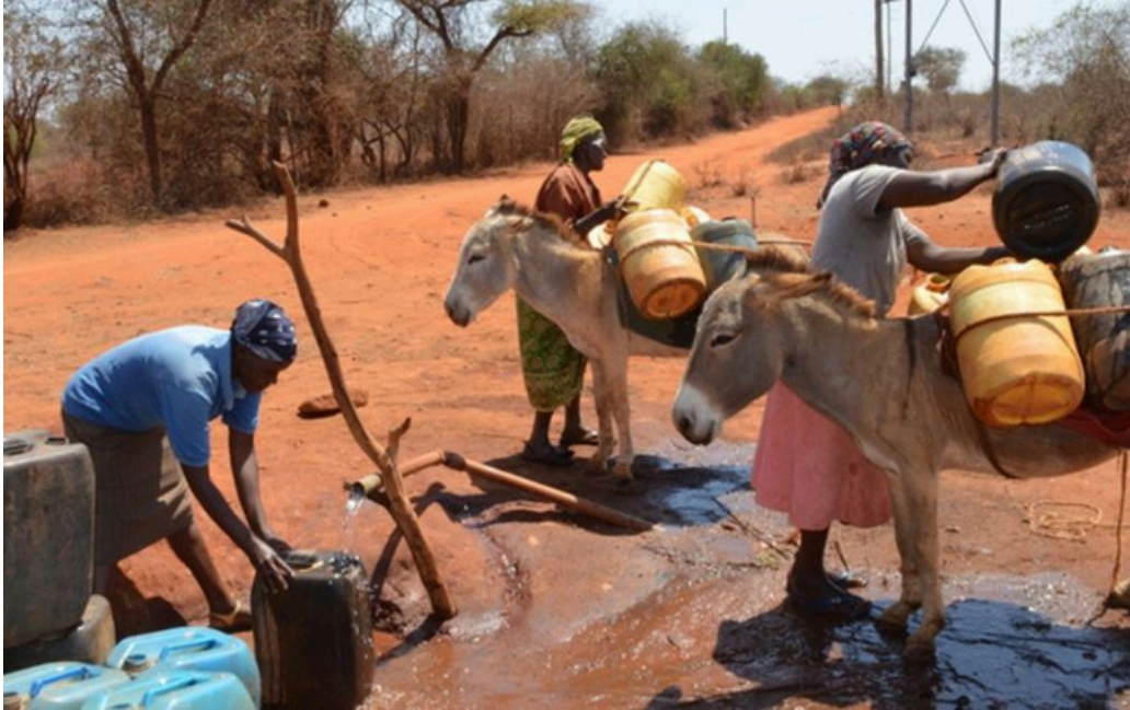
Contaminated Drinking Water

Fetching water is a daily chore for most families where the women and young girls can spend up to two hours depending on how far they have to go just to fetch water which only makes them sick when they drink it. Since this chore is never ending and requires much time and labor in order just for the family to survive often times means girls miss school to help subsidize the family division of labor. Leaving school to the oldest or most gifted. And since education is one of the very few pathways out of poverty the ability to go to school remains a coveted position within the family. Not everyone gets to go to school.