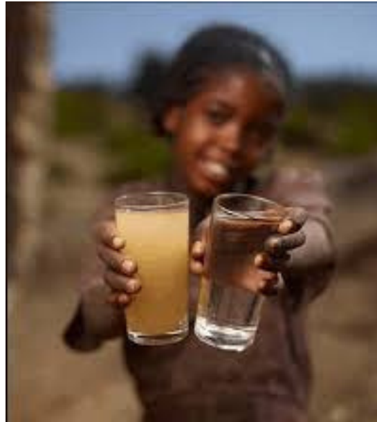
Results of a New Life Filter